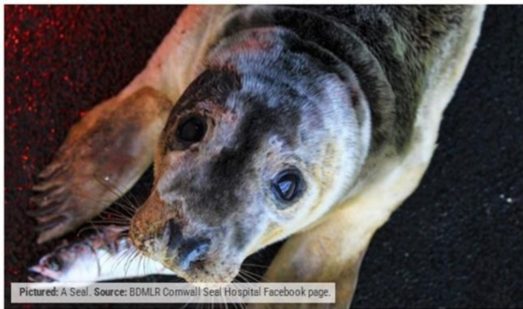
Pictured: A Seal.

Do you think you would enjoy volunteering to help animals?