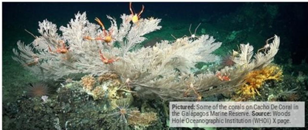
Pictured: Some of the corals on Cacho De Coral in the Galápagos Marine Reserve.

A recent expedition has found two pristine, ancient, cold-water coral reefs in the Galápagos Islands Marine Reserve that are filled with life! The marine reserve is one of the largest in the world. It covers 133,000 square kilometres and surrounds the Galapagos Islands in the eastern Pacific Ocean. The research, conducted by scientists from the Schmidt Ocean Institute, has discovered one reef that measures 800 metres, and another that is 250 metres long. The reefs have been dated as thousands of years old. 'The Galápagos Marine Reserve is an area of outstanding biological importance,