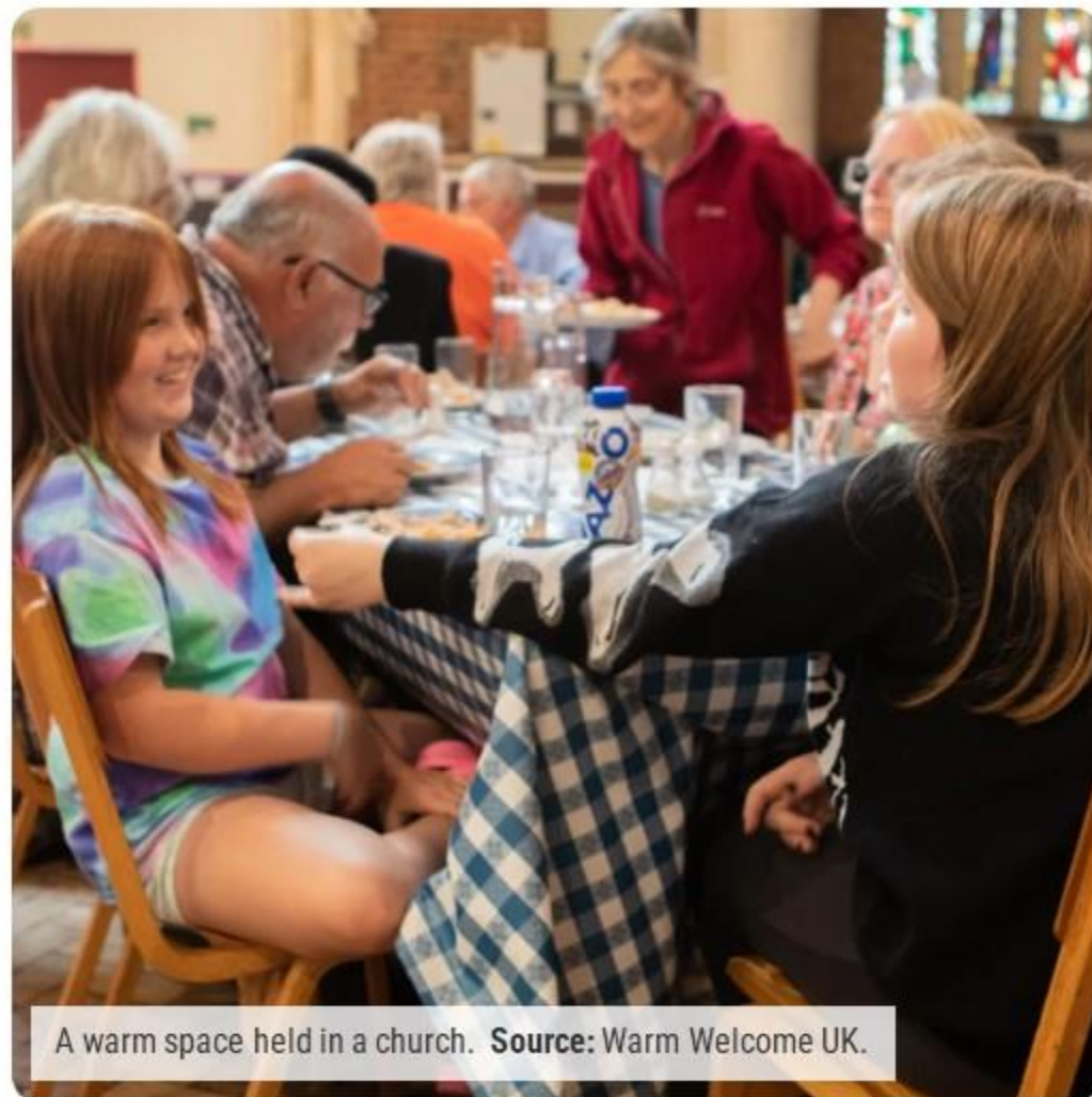
A warm space held in a church.

Many warm spaces provide other community support and activities, including free hot drinks, children's film evenings, coffee mornings for elderly people, and 'knit and natter' sessions, with the aim of bringing communities together.