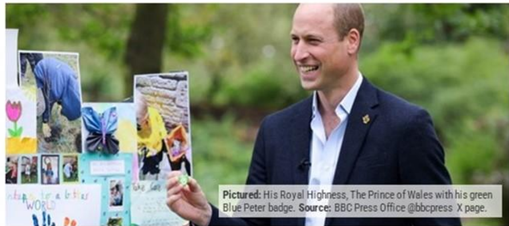
Pictured: His Royal Highness, The Prince of Wales with his green Blue Peter badge.