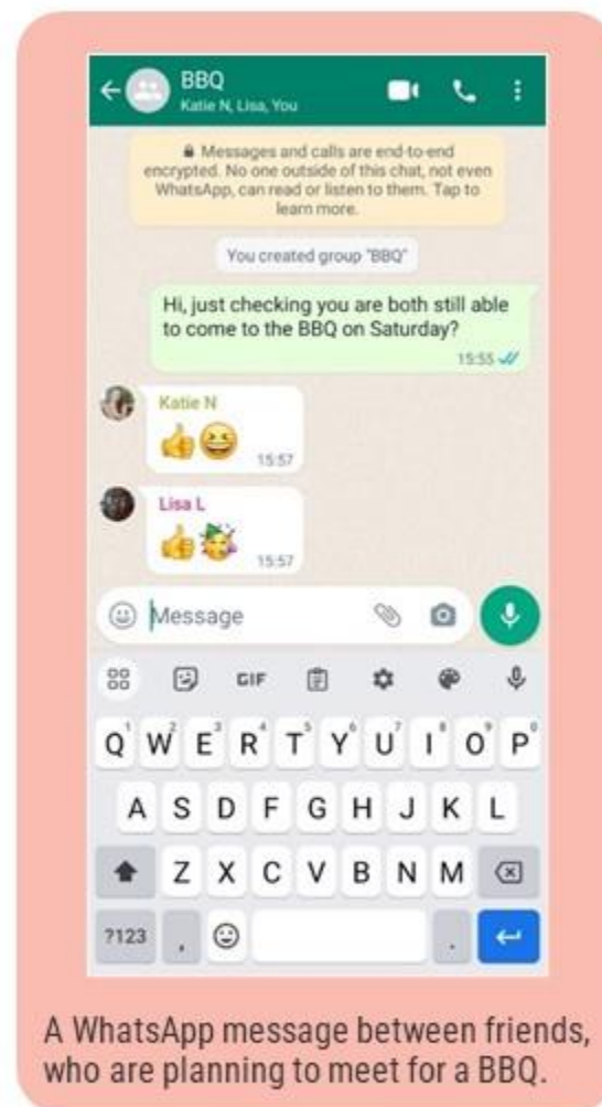
A WhatsApp message between friends, who are planning to meet for a BBQ.

What emojis have been used in the Picture News post and the WhatsApp message? Why have they been used?