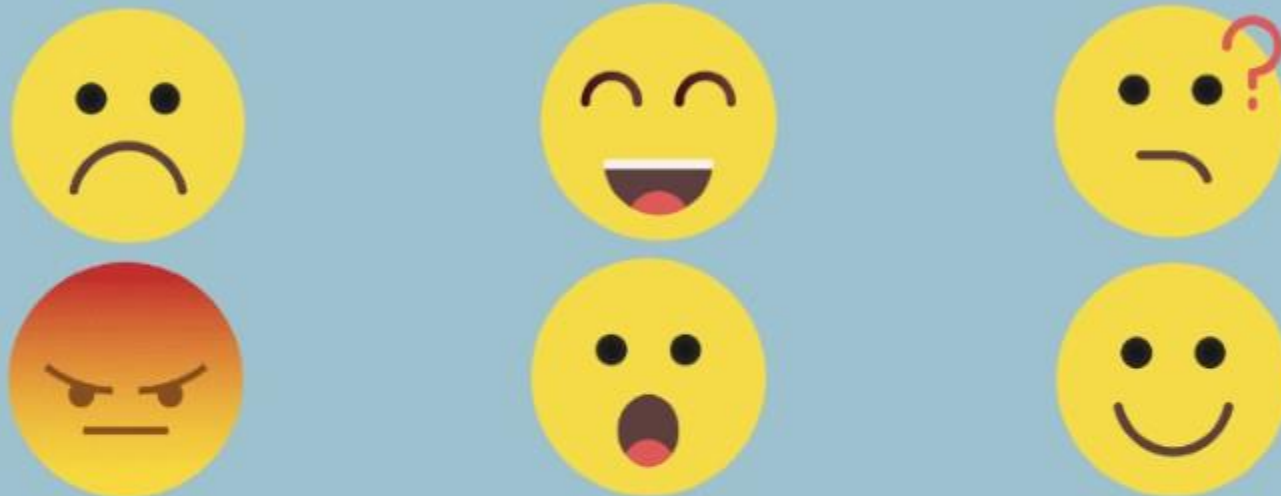
Smiley/emotion face emojis.

There are thousands of different emojis that people use for different reasons. Look at the examples below: