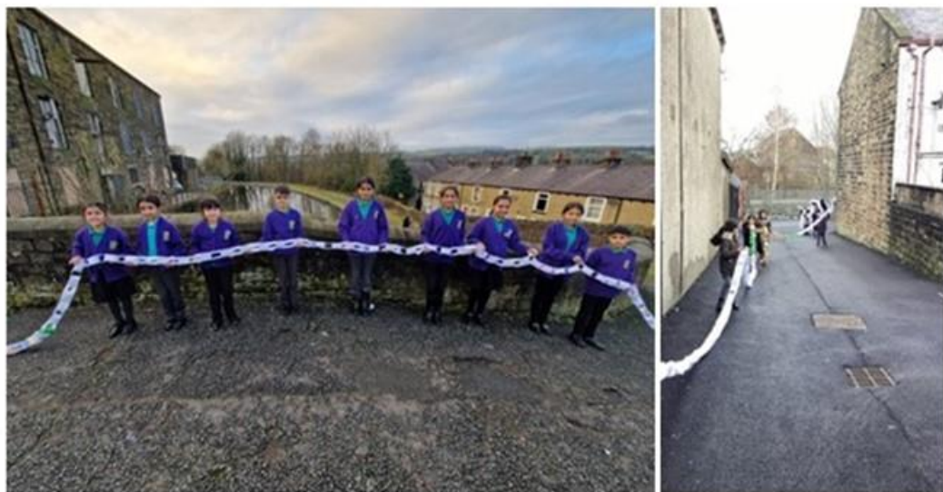
Pictured left: Pupils from Lomeshaye Junior School holding their peace chain. Pictured right: Pupils from Whitefield Infant School carrying their peace chain.