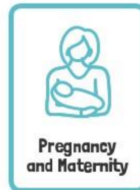
Pregnancy and Maternity