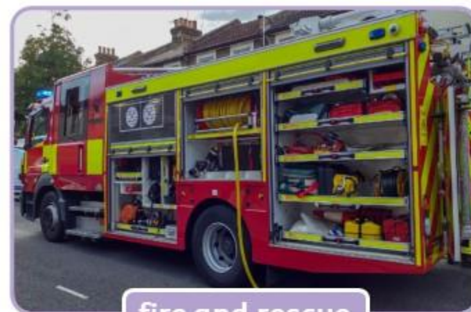
fire and rescue