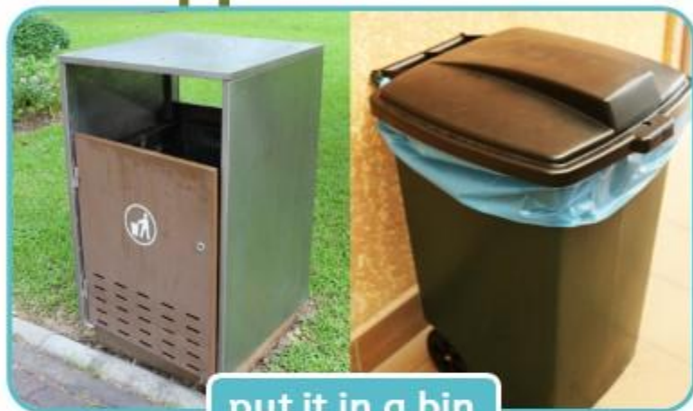
put it in a bin

Look at some of the different things we can do with rubbish.