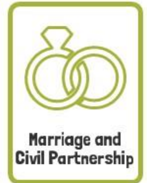
Marriage and Civil Partnership