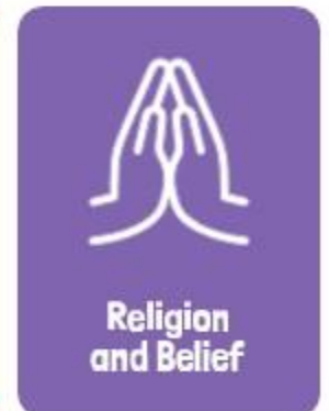
Religion and Belief