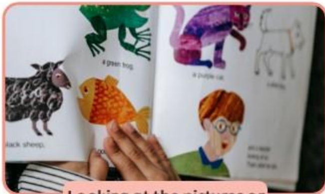
Looking at the pictures or reading the words.