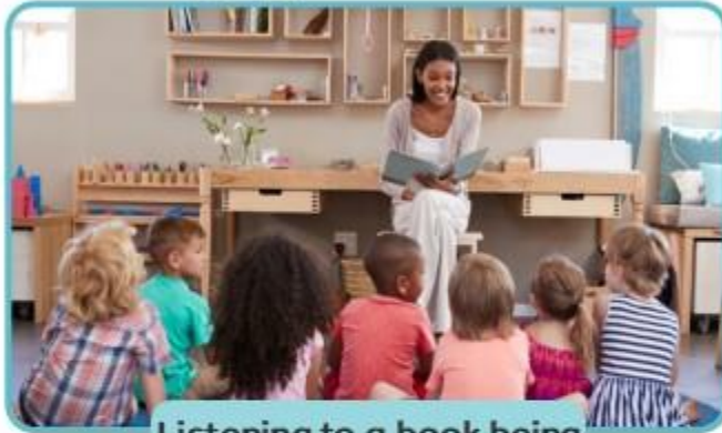
Listening to a book being read to us.

Look at and discuss the different things we may enjoy about books.