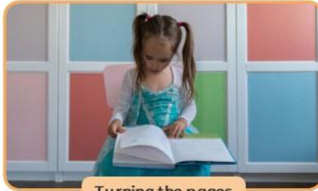
Turning the pages of a book.