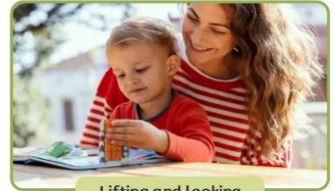
Lifting and looking under flaps in books.