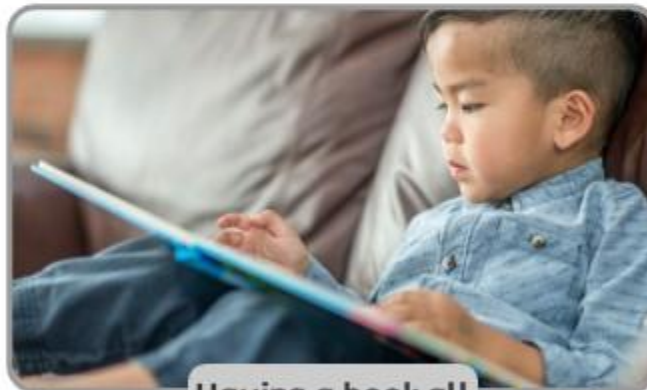
Having a book all to yourself.