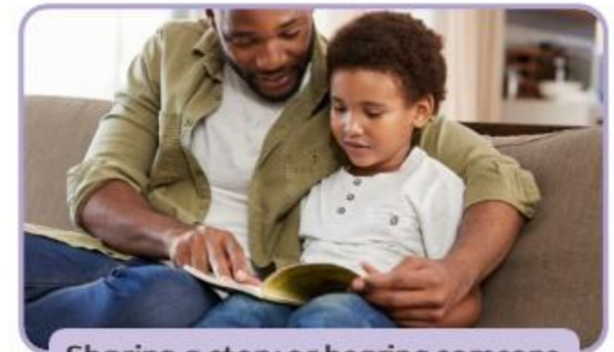
Sharing a story or hearing someone do funny character voices.