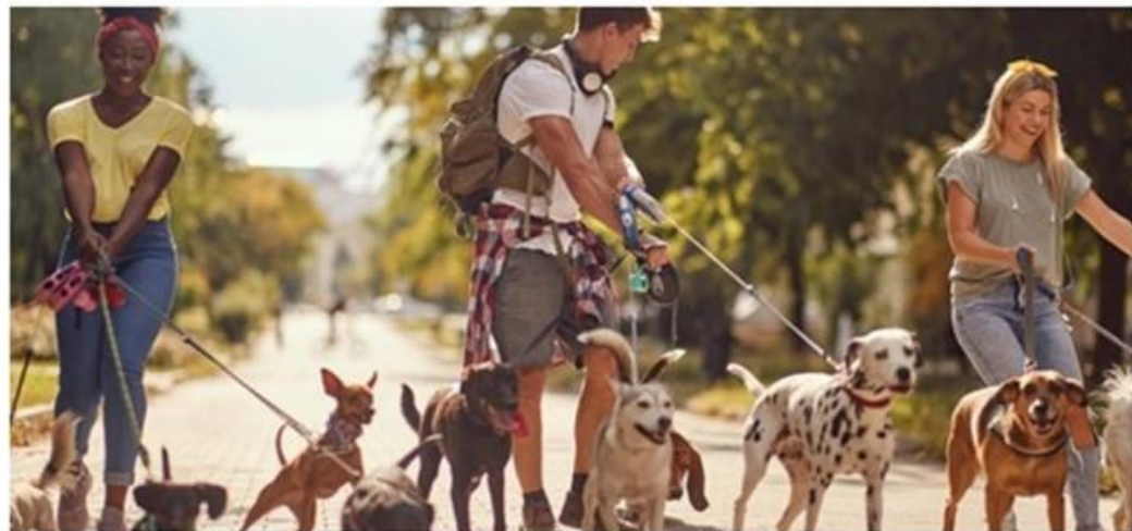
Pictured: A Dog Walk.

Researchers from Max Planck Institute for Psycholinguistics in the Netherlands and the University of Rome have been looking into why dogs might wag their tails. The four scientists have recently published their results and some of them might surprise you! Most people think that dogs wag their tails when they are happy or excited, but this may, in some cases, show nervousness or submission. The scientists said they found that dogs wag their tails much more than other animals that are closely related to them, for example, wolves. Canines in the wild use their tails to improve their balance and to swat away insects. These experts looked at the existing research on tail-wagging and concluded that there may be two reasons why dogs wag their tails so much. The