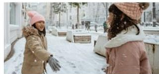
Pictured: Playing in the snow.