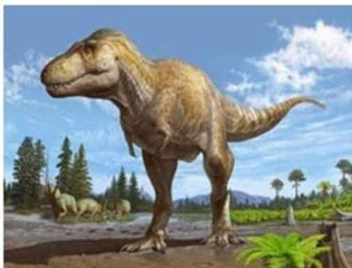
Pictured: An image of Tyrannosaurus mcraeensis released by the New Mexico Museum of Natural History and Science.

A new giant dinosaur species, called Tyrannosaurus mcraeensis , has been discovered in New Mexico, USA. Palaeontologists made the announcement after examining parts of the animal's fossilised skull that had been found at the Hall Lake Formation, a geological formation in Sierra County. The skull is currently on display at the New Mexico Museum of Natural History & Science (NMMNHS). 'Once again, the extent and scientific importance of New Mexico's dinosaur fossils becomes clear – many new dinosaurs remain to be discovered in the state, both in the rocks and in museum drawers!' said Dr. Spencer Lucas, Paleontology Curator at NMMNHS. The massive carnivore, thought to have lived approximately five million years before the Tyrannosaurus rex (T. rex), is thought to be its closest relative! The huge theropods that lived between 71 and 73 million years ago, would have been similar in size to their relative the T. rex – 12m long, up to 4m high and weighing around 8.8 tonnes. Like the T. rex, their humongous skulls