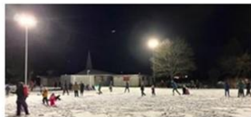
Pictured: The community fun snowball fight at Strathburn Park.

How do you think it would feel to be involved in a snowball fight with hundreds of people? How many people do you think have been in the largest snowball fight ever?