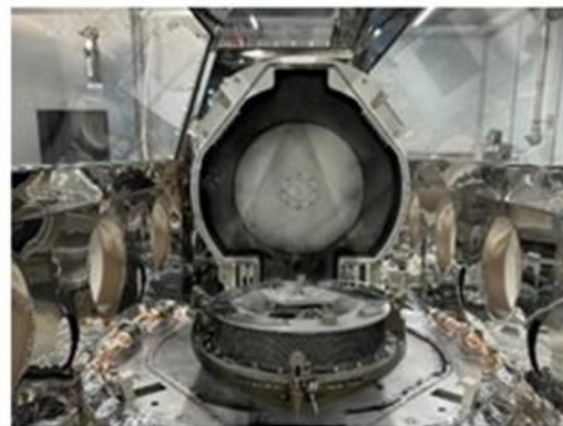
Pictured: The OSIRIS-REx asteroid sample return canister.

Share your thoughts and read the opinions of others